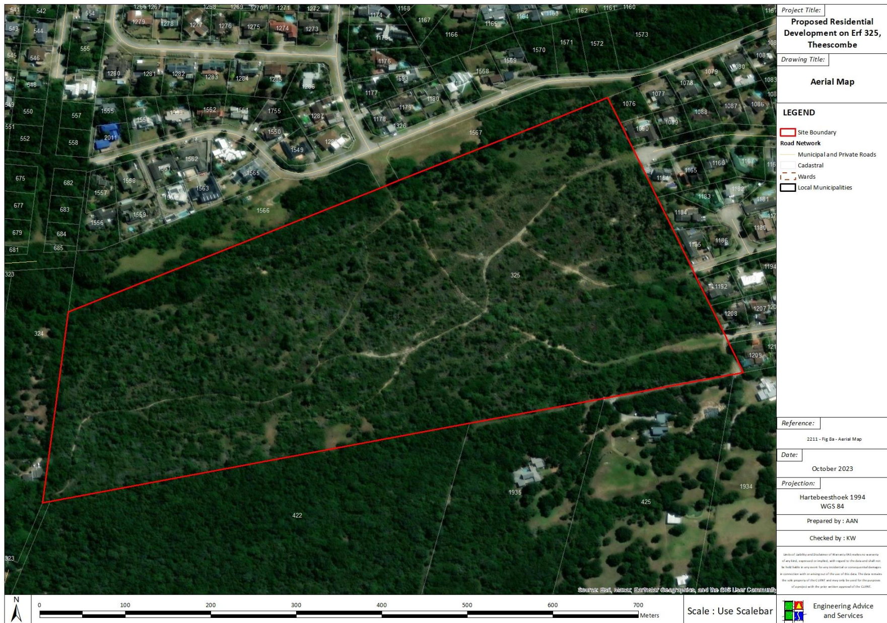
Figure 2: Aerial Map of the site