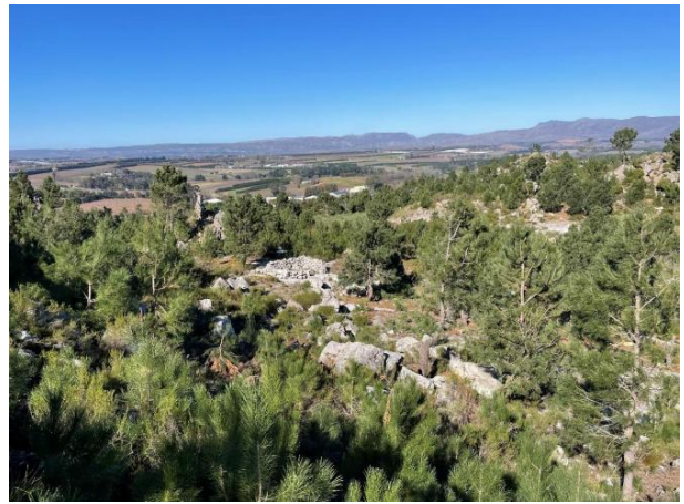
Pine-infested northern part of Portion 9 of Farm 313