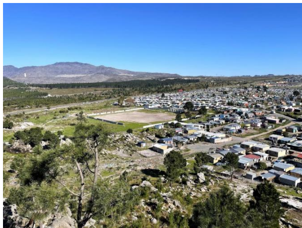
North-western part of Portion 9 of Farm 313, with the sports field visible in the distance