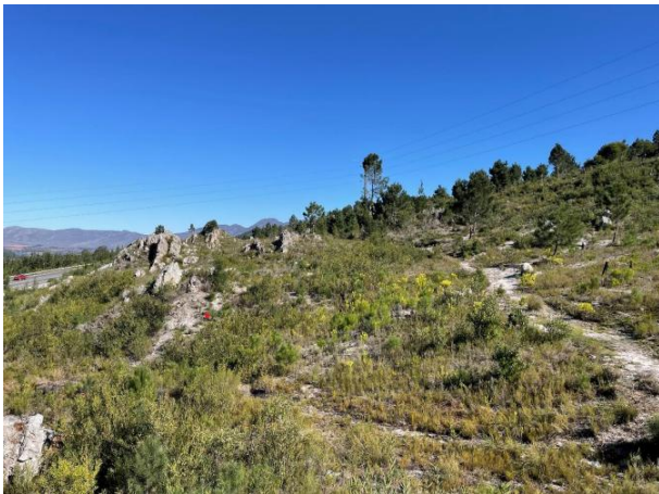
Eastern corner of Portion 9 of Farm 313